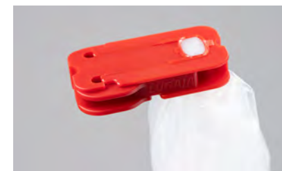
Lugaia SafeSeal Crimp