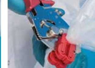
Cut through / separate