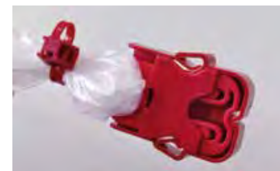
Installed protective cap