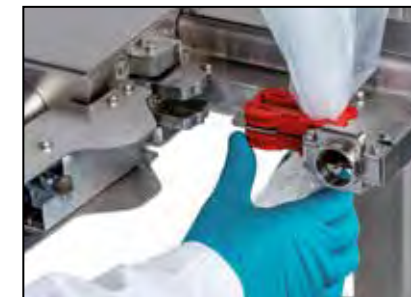
Insert SafeSeal Crimp