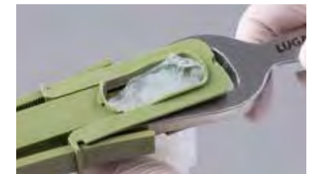
Separate the crimps