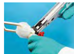
Tighten cable ties