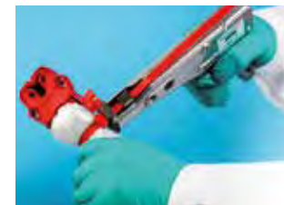
Tighten cable ties