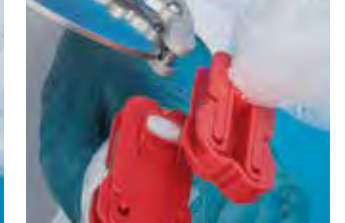
Both parts locked