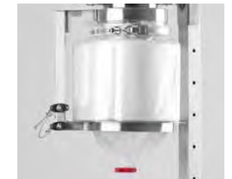
Continuous Liner System (CLS)