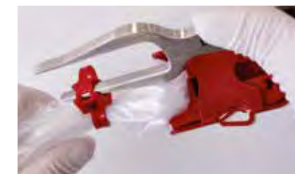
Loosen the cable tie cover