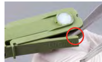
Break open the safety brackets on both sides