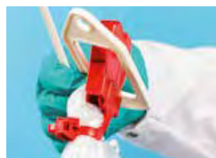
Slip the hanging tool on