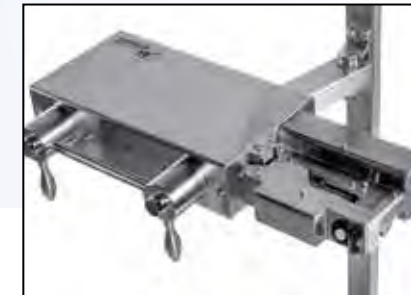
SafeSeal Pneumatic Tool