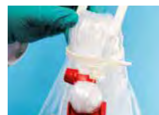
Put on cable ties