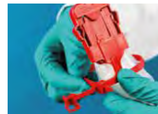
Put on cable ties