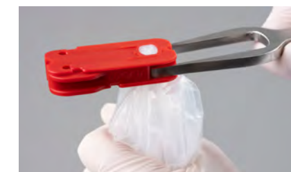
Insert the opener, the outer crimp opens