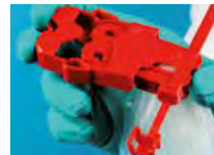
Put on the protective cap