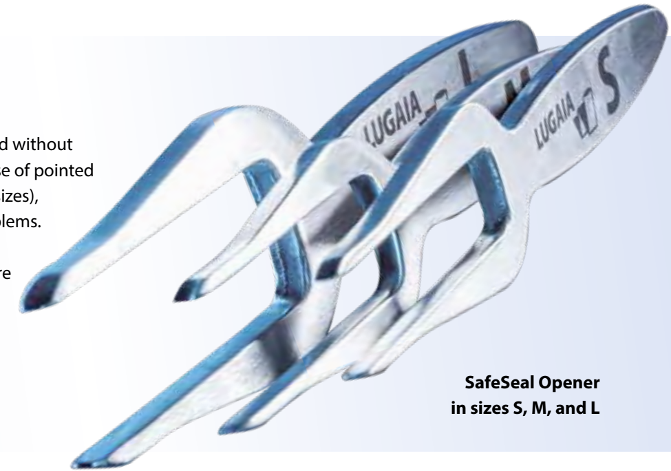
SafeSeal Opener in sizes S, M, and L

Scan the QR code and watch directly the video