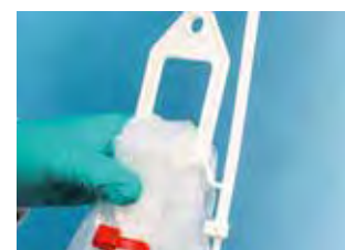
Bend the foil