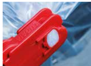
Lugaia SafeSeal Crimp