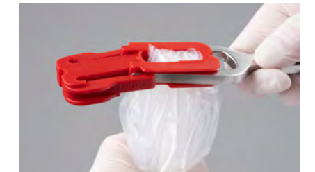
Separate the crimps