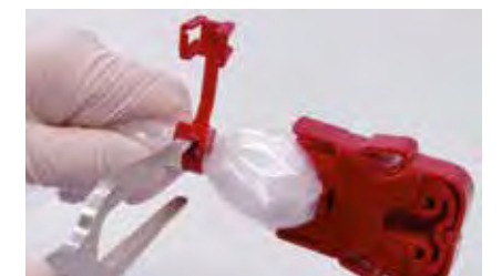
Loosen the cable ties